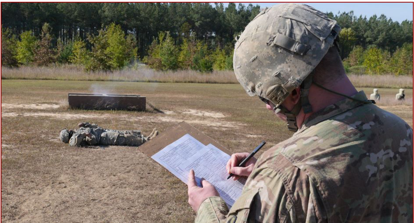
A 2nd Battalion, 198th Armored Regiment, 155th Armored Brigade Combat Team, Soldier evaluates a Soldier's performance with the practice version of the M67 fragmentation hand grenade during his unit's weekend drill at Camp McCain on Oct. 17. The training strengthens proficiency at throwing grenades at targets from the standing and kneeling positions, as well as throwing while lying down.

In the beginning, the camp was administered by the local unit in Grenada. As usage increased, the demand for more facilities also increased. In the mid to late 60's, the 223rd Engineer Battalion constructed mess sheds, quonset huts, a latrine, and some of the first roads in the tactical area. In 1969, tracked vehicles were added to Camp McCain, and 1971 a maintenance facility was built. The open-