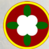
184TH EXPEDITIONARY SUSTAINMENT COMMAND LAUREL, MISS.