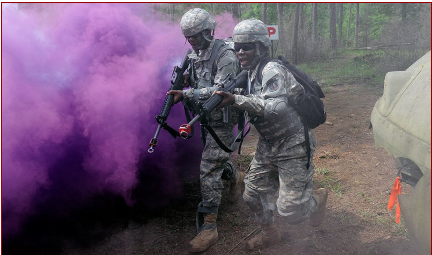
Mississippi Magnolia Guard Officer Leadership Development (GOLD) Program Soldiers practice tactical scenarios during annual training at the Camp Shelby Joint Forces Training Center. The Magnolia GOLD program offers leadership development courses primarily to Mississippi community college students, preparing them to pursue a commission in the Mississippi Army National Guard.