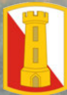
168TH ENGINEER BRIGADE VICKSBURG, MISS.