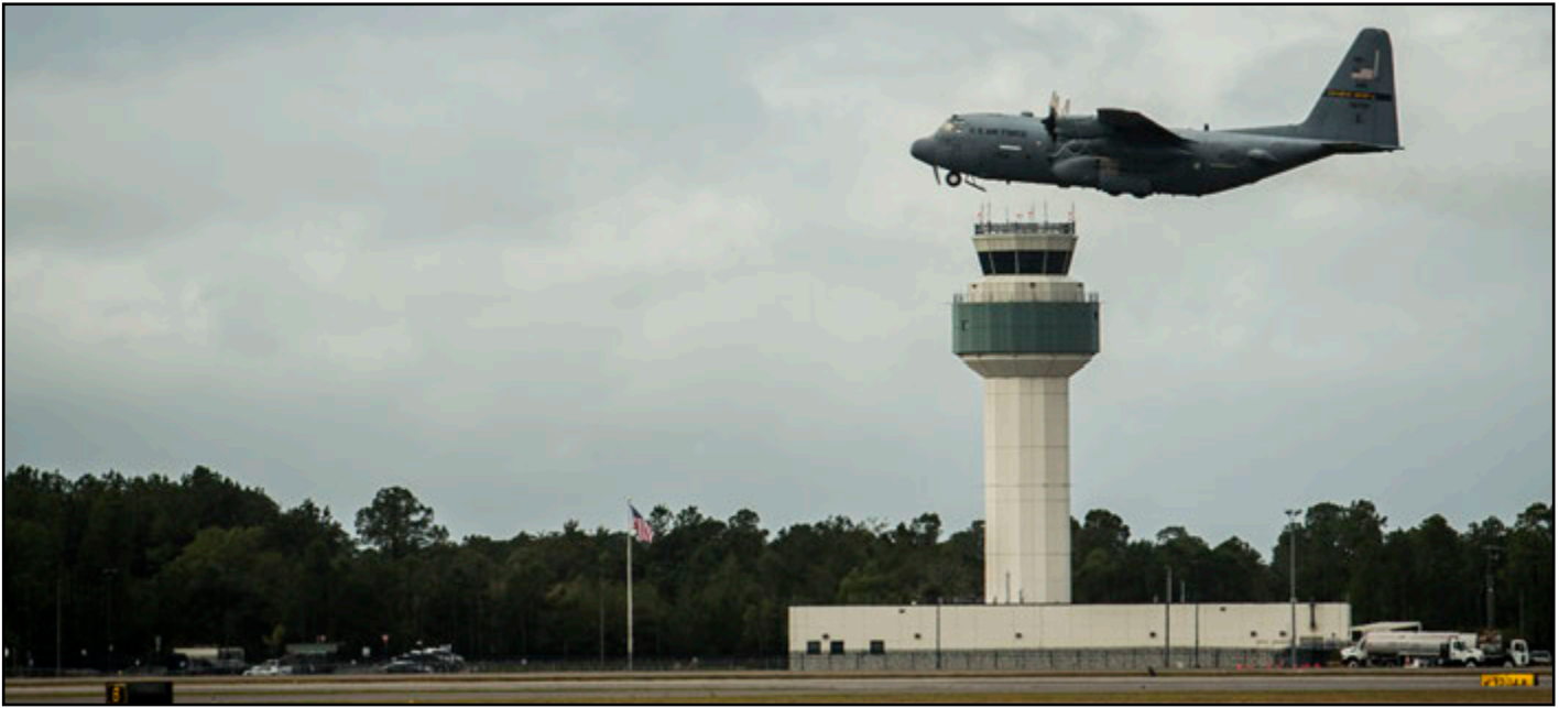
A West Virginia Air National Guard C-130 Hercules takes off from the flight line during Exercise Southern Strike 16 at the Gulfport Combat Readiness Training Center on Oct. 26. Exercise Southern Strike 16 is a total force, multi-service training exercise hosted by the Mississippi Air National Guard's CRTC from Oct. 26 through Nov. 6. The exercise emphasizes air-to-air, air-to-ground and special operations forces training opportunities.

ing of the tactical areas caused many changes, including the organization of the 221st Engineer Detachment. This unit is now named Detachment 2, State Area Command.