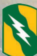
155TH ARMORED BRIGADE COMBAT TEAM TUPELO, MISS.