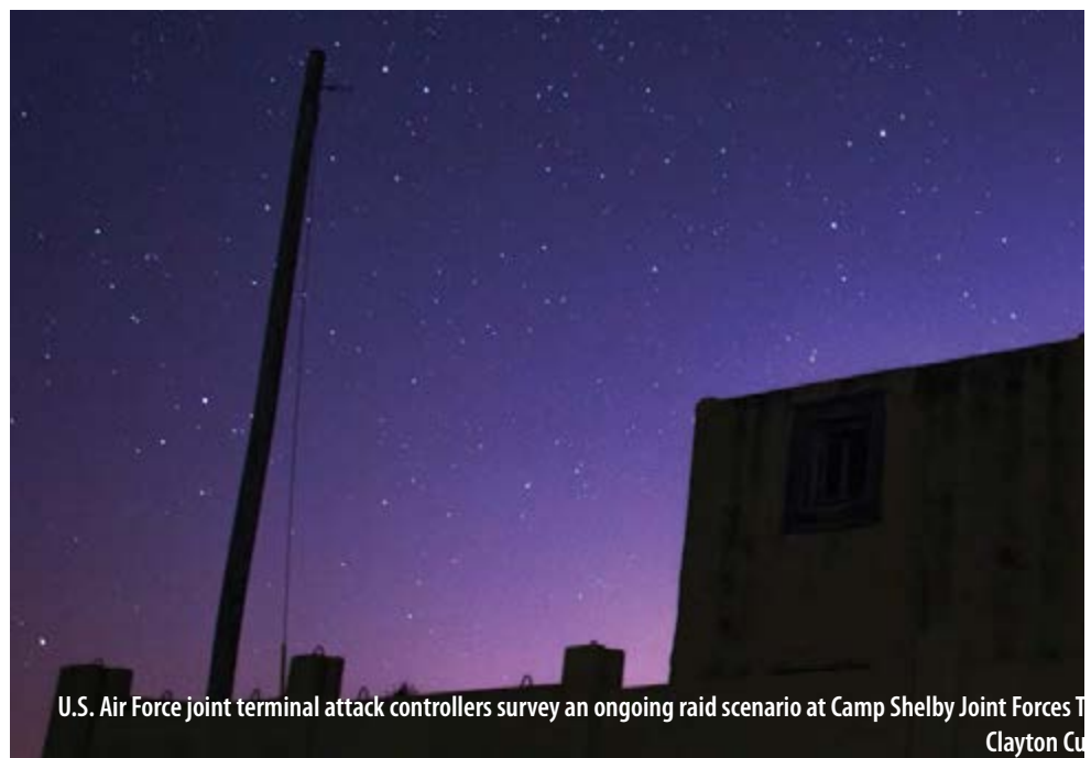
U.S. Air Force joint terminal attack controllers survey an ongoing raid scenario at Camp Shelby Joint Forces Training Center at night.