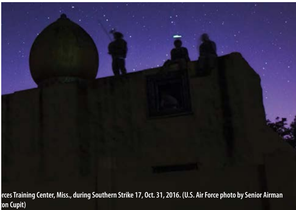
Forces Training Center, Miss., during Southern Strike 17, Oct. 31, 2016.

At Southern Strike 17, the 238th trained with the National Guard’s 3rd Special Forces Group from North Carolina, Naval Special Warfare Team, the 122nd ASOS from Louisiana, and the 165th ASOS from Georgia, as well as the Air Force’s 11th ASOS from Ft. Hood, Texas. ■