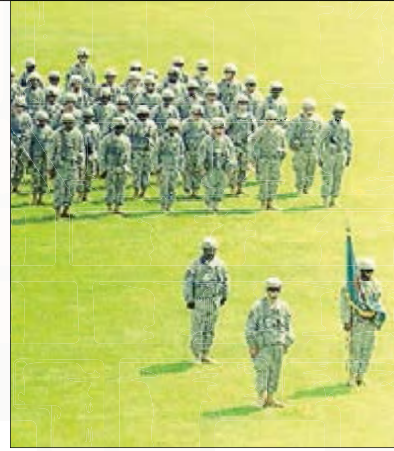
at the National 150th Combat Engineer Battalion, OIF III, Al rwin, Calif