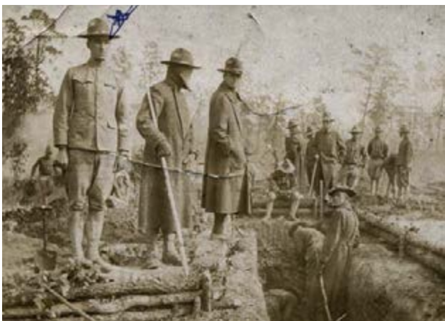
Soldiers mobilizing for World War I dig trenches at Camp Shelby in 1917. The trenches were used to prepare them for trench warfare in Europe.

The clues continue to mount as the investigation continues, but the historian said she expects to publish her findings within the next year. ■