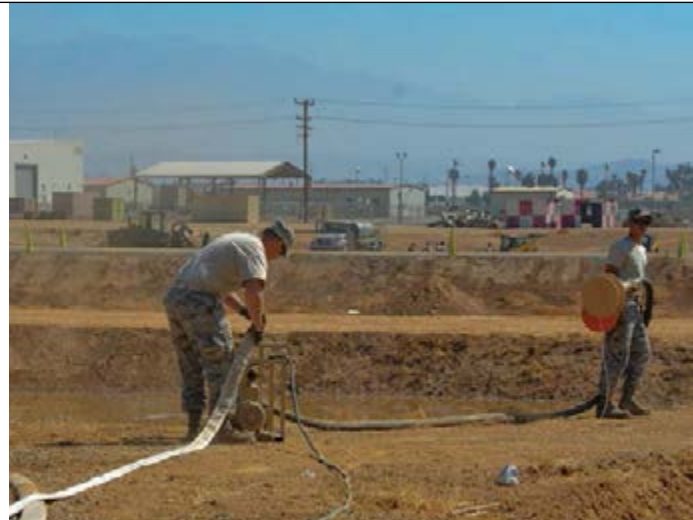
Members of the 172d Airlift Wing’s Civil Engineering Squadron prepare to drain water from a pond to process it through the Reverse Osmosis Water Purification Unit.