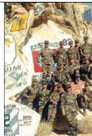
Combat Engineer Battalion at the National Training Center in Fort. Irwin, Calif.