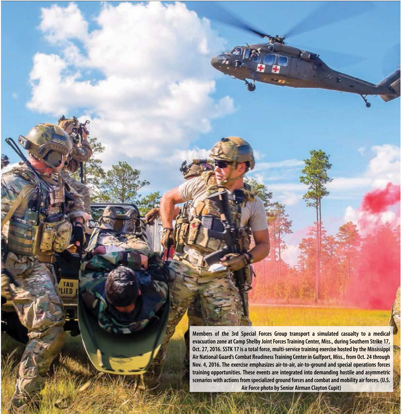
Members of the 3rd Special Forces Group transport a simulated casualty to a medical evacuation zone at Camp Shelby Joint Forces Training Center, Miss., during Southern Strike 17, Oct. 27, 2016. SSTK 17 is a total force, multi-service training exercise hosted by the Mississippi Air National Guard's Combat Readiness Training Center in Gulfport, Miss., from Oct. 24 through Nov. 4, 2016. The exercise emphasizes air-to-air, air-to-ground and special operations forces training opportunities. These events are integrated into demanding hostile and asymmetric scenarios with actions from specialized ground forces and combat and mobility air forces.

Joint Force Headquarters Mississippi National Guard P.O. Box 5027 Jackson, MS 39296-5027