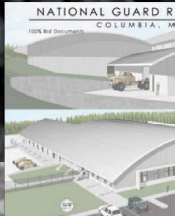
Work has started to build a new Columbia, Miss. Army National Guard Readiness Center on Dec. 23, 2014. The new readiness center will cover 42,881 square feet and include a parking lot for 100 vehicles. The center is being built by the 150th Brigade, Company A.