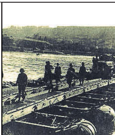
The original 150th Combat Engineers bridging the Rhine River during World War II.

The memories of these men are honored in the hallways of the battalion headquarters in Meridian, Miss., as well as in the battalion crest.