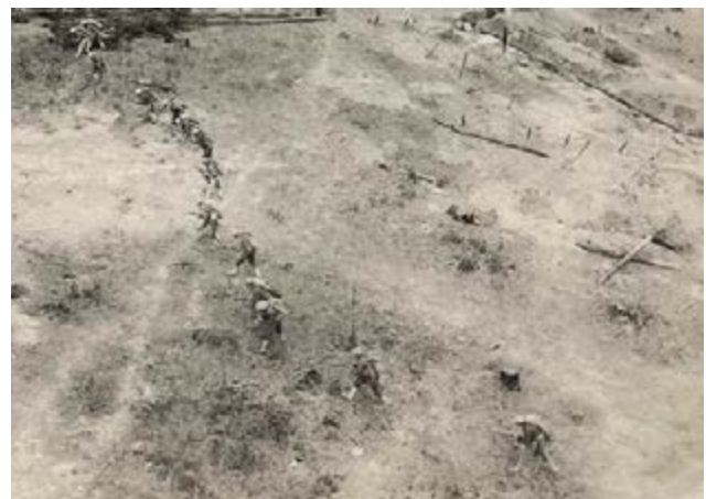
Soldiers sprint across "no man's land" at Camp Shelby during World War 1 in 1917. "No man's land" was a term used in WWI to describe the scarce and dangerous area between two opposing trenches.