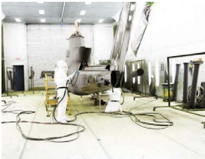
Members of the 1108th Aviation Group restore an AH-1 Cobra helicopter to its original paint color.