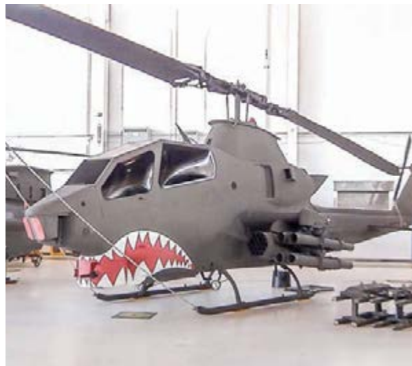
The finished product is ready to be displayed after numerous hours of hard work and craftsmanship by 1108th personnel.