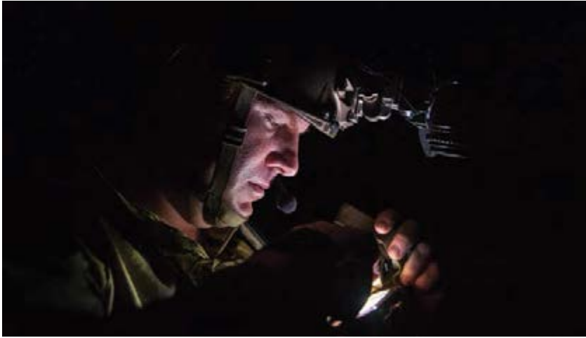
A U.S. Air Force joint terminal attack controller prepares his gear prior to a raid scenario at Camp Shelby Joint Forces Training Center, Miss., during Southern Strike 17, Oct. 31, 2016.

» “You have to really have it in your heart that your mission is to ultimately advise the Army, and drop ordinances to save lives on the battlefield. If you don’t have the mission in your heart, you’re not going to make it through.”