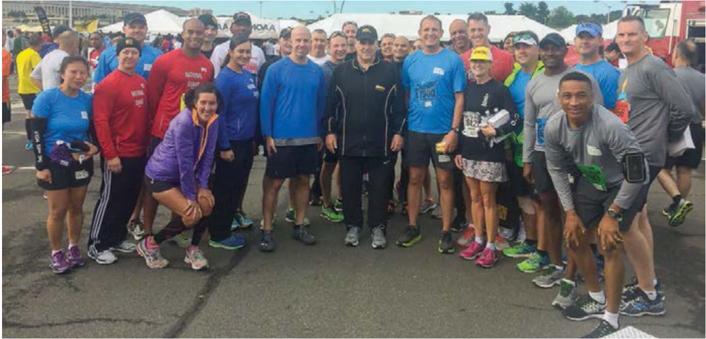
Over 30 members of the Mississippi National Guard ran in the Army's thirty second Army Ten Miler race Oct. 9, 2016, in Arlington, Va. The group is photographed with Gen. Mark A. Milley, chief of staff of the Army. The mission of the Army Ten Miler is to promote the Army, build esprit de corps, support Army fitness goals, and enhance community relations.