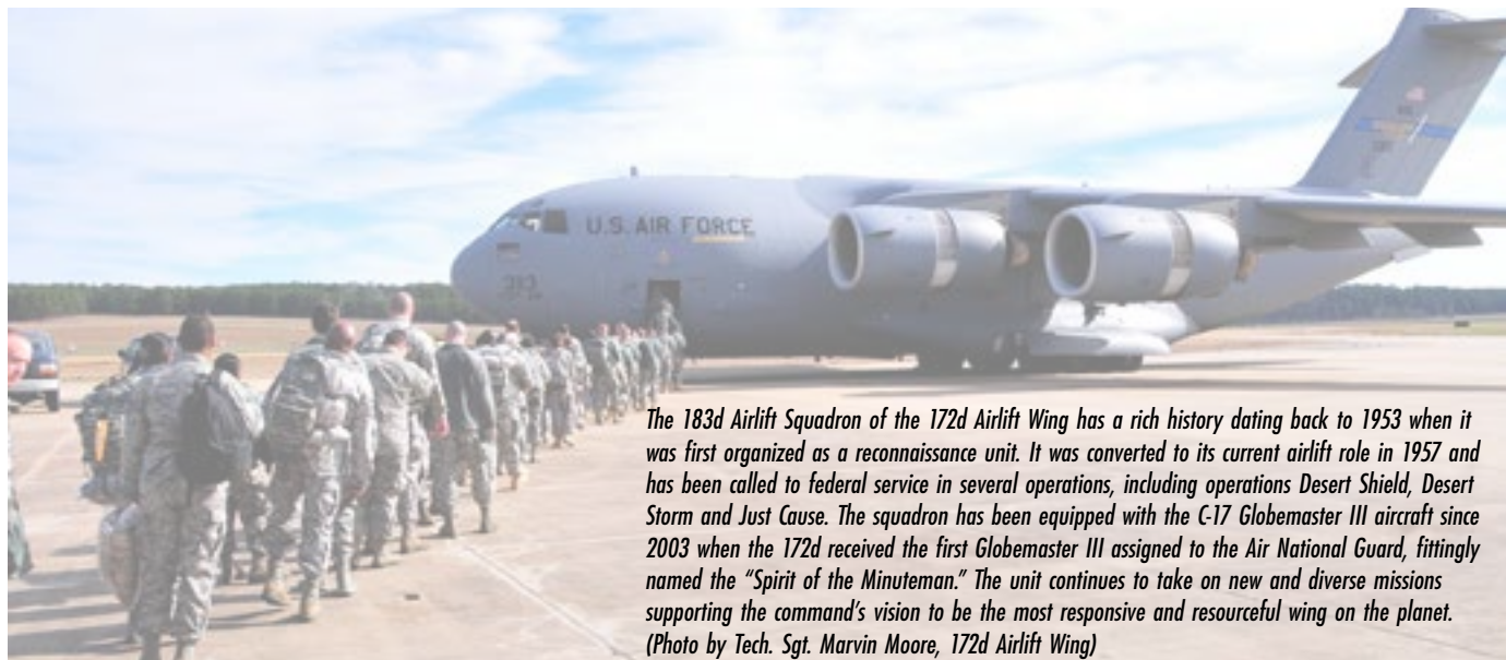
The 183d Airlift Squadron of the 172d Airlift Wing has a rich history dating back to 1953 when it was first organized as a reconnaissance unit. It was converted to its current airlift role in 1957 and has been called to federal service in several operations, including operations Desert Shield, Desert Storm and Just Cause. The squadron has been equipped with the C-17 Globemaster III aircraft since 2003 when the 172d received the first Globemaster III assigned to the Air National Guard, fittingly named the "Spirit of the Minuteman." The unit continues to take on new and diverse missions supporting the command's vision to be the most responsive and resourceful wing on the planet.