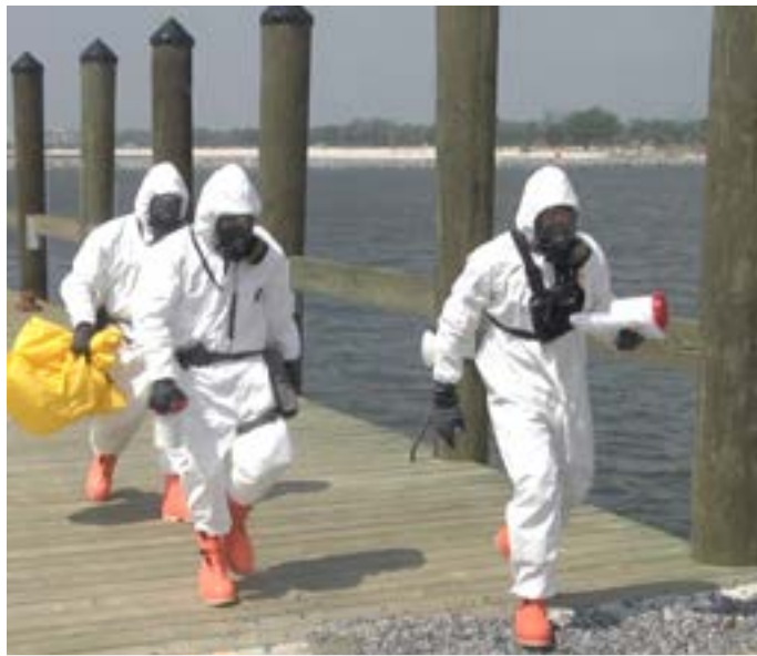
Members of the 209th Special Operations Civil Engineer Squadron dispose of hazardous material during the joint training Exercise Marlinspike II April 3-6, 2017 in Gulfport, Miss.